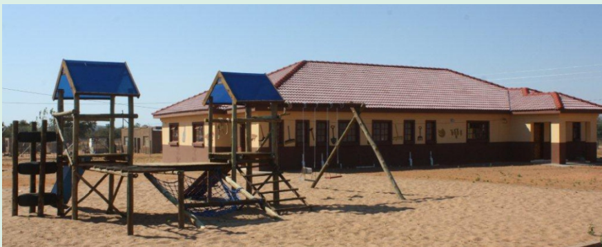
The immaculate view of the Motadi Crèche