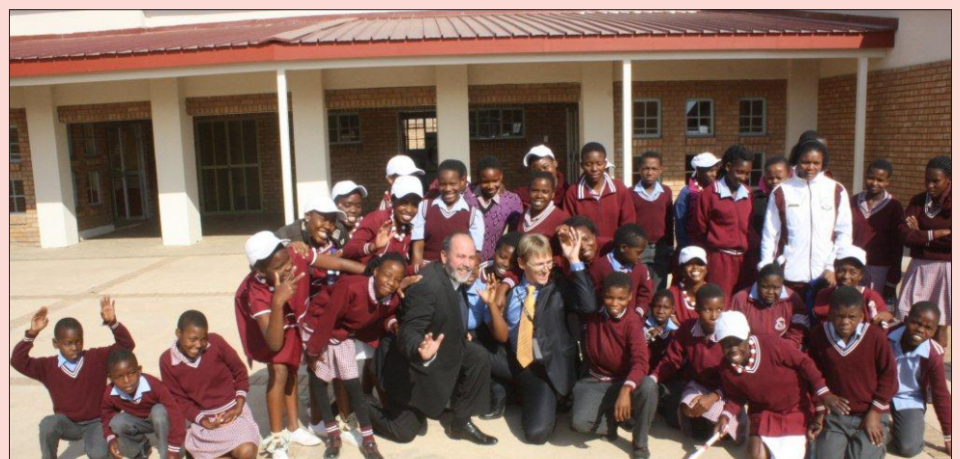
Ratanang Special School learners show appreciation to the De Beers Consolidated Mines management for their provision of much needed shelter to the school.