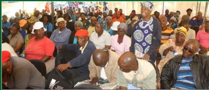
The community also had their voices heard.

Mayor indicated that there is a road maintenance plan in place which will be looked at and make sure that issues raised by the community members pertaining to roads are well taken care of.