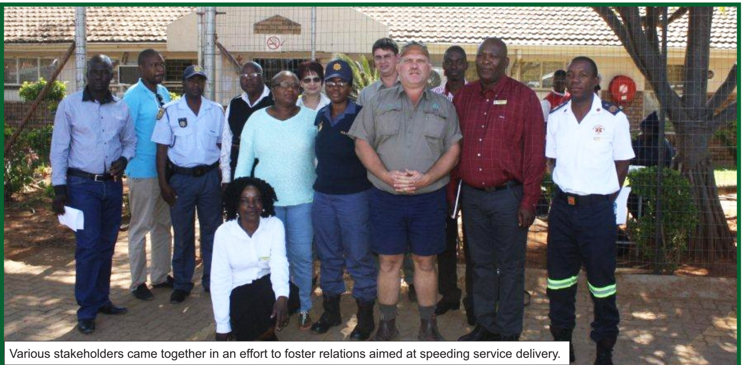
Various stakeholders came together in an effort to foster relations aimed at speeding service delivery.